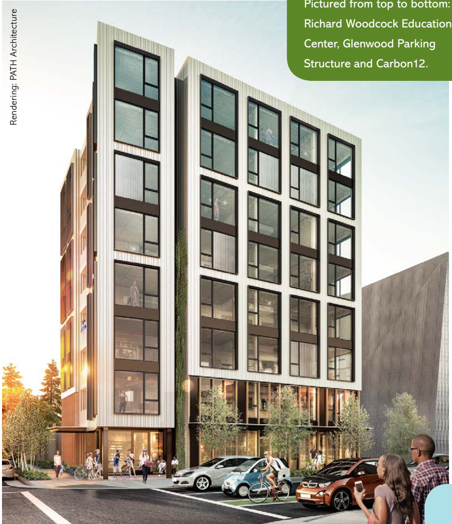
Rendering: PATH Architecture