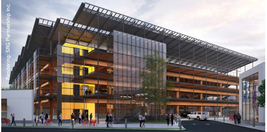
Rendering: SRG Partnership Inc.