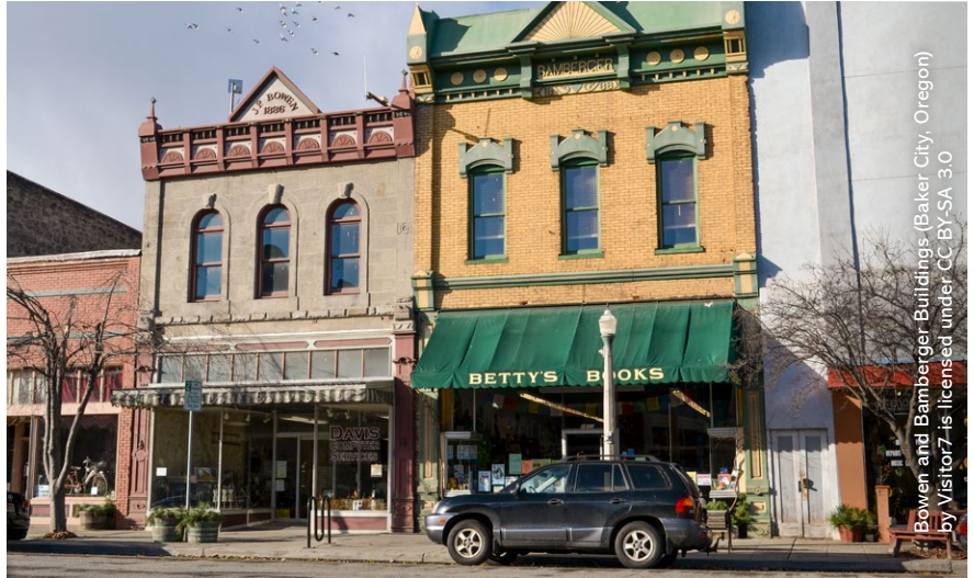
Bowen and Bamberger Buildings (Baker City, Oregon)

The main concern – the forest itself – is a double-edged sword. On the one hand, given the dense, overstocked stands of ponderosa pine and mixed conifers, wildfire is an ever-present risk. Post-fire impacts such as sedimentation and its effects on water treatment infrastructure pose potential issues. However, many slopes in the watershed exceed a gradient of 30 percent, and many are considered “very steep” at over 60 percent, although the well-drained soils reduce the risk of landslides. Thinning forest stands through forest management could lead to increased erosion, turbidity and chemical changes.