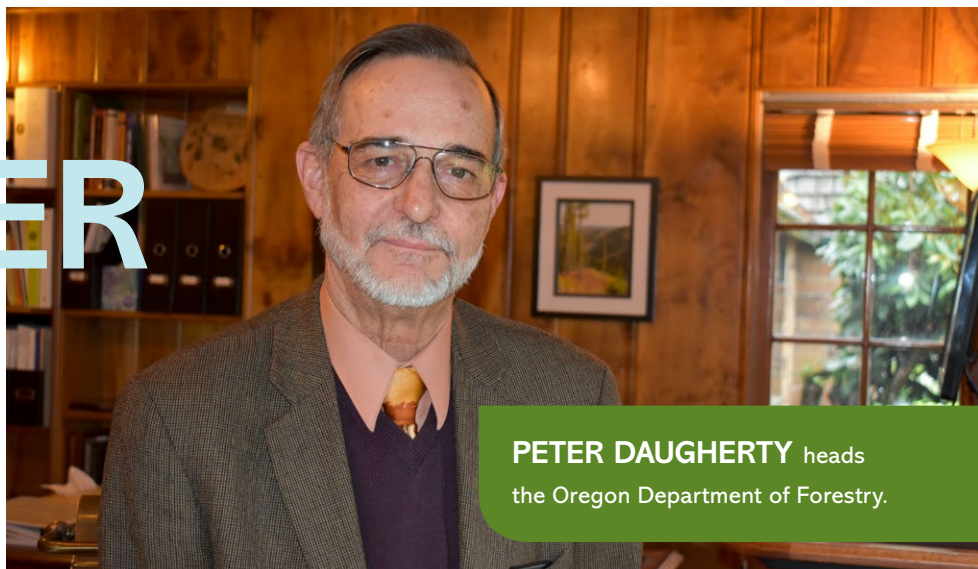
PETER DAUGHERTY heads the Oregon Department of Forestry.

Among its 36 recommendations, the council called for more than 100 new staffing positions at various state agencies, $20 million in initial investments in non-staffing-related costs, and $200 million annually to treat 300,000 acres per year to restore and maintain fire-resilient landscapes.