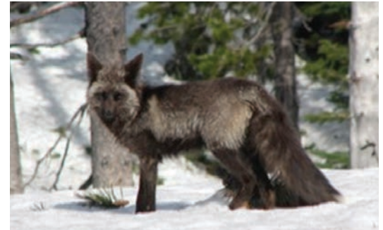
Sierra Nevada red fox in the Oregon Cascades at 4,800 foot elevation.

SNRF are often found in remote and inaccessible areas. In Oregon, SNRF have been found in high-elevation subalpine meadows and forests of the Cascade Mountains, as well as high-use recreation areas such as ski resorts and campgrounds. Sightings range from Mount Hood to Crater Lake (Oregon Department of Fish & Wildlife). SNRF prey on small mammals such as rabbits, mice and voles, as well as carrion (typically road-killed deer). Little is known about their range, distribution, population size and reproduction. Ongoing research projects in both Oregon and California are beginning to shape the answers to some of these unknowns.