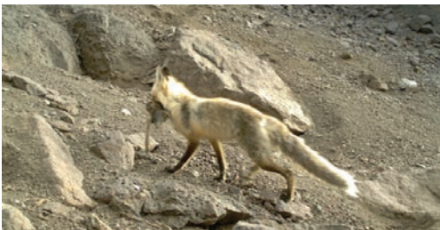
Sierra Nevada red fox

Research on SNRF is ongoing. With better understanding of their distribution, habitat requirements and subspecies delineation, management strategies can be developed.